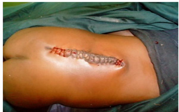
Figure 3. Same child after surgery.