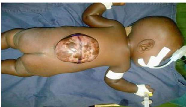
Figure 2. Child with myelomeningocele before surgery.